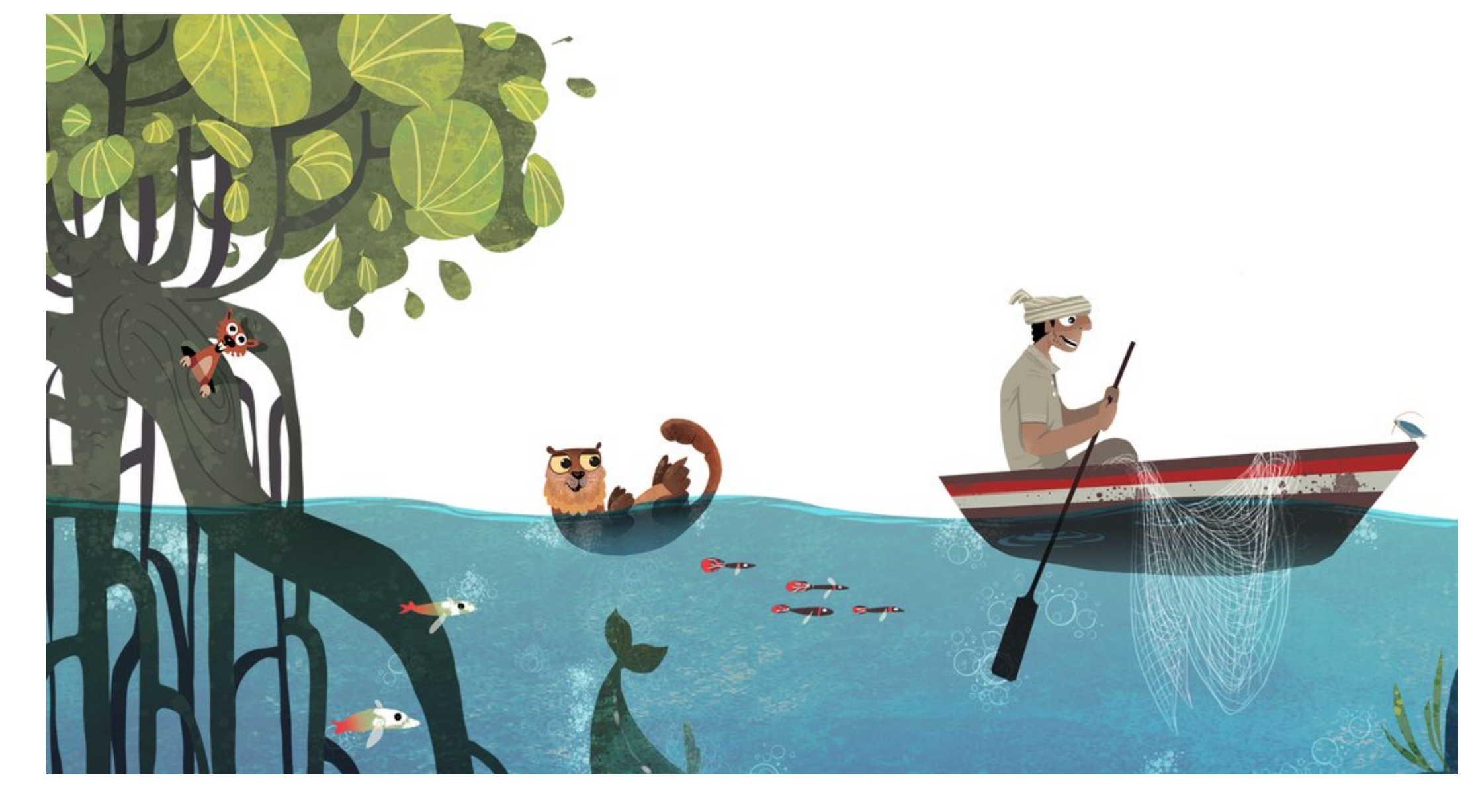
Once, a fisherman came fishing.