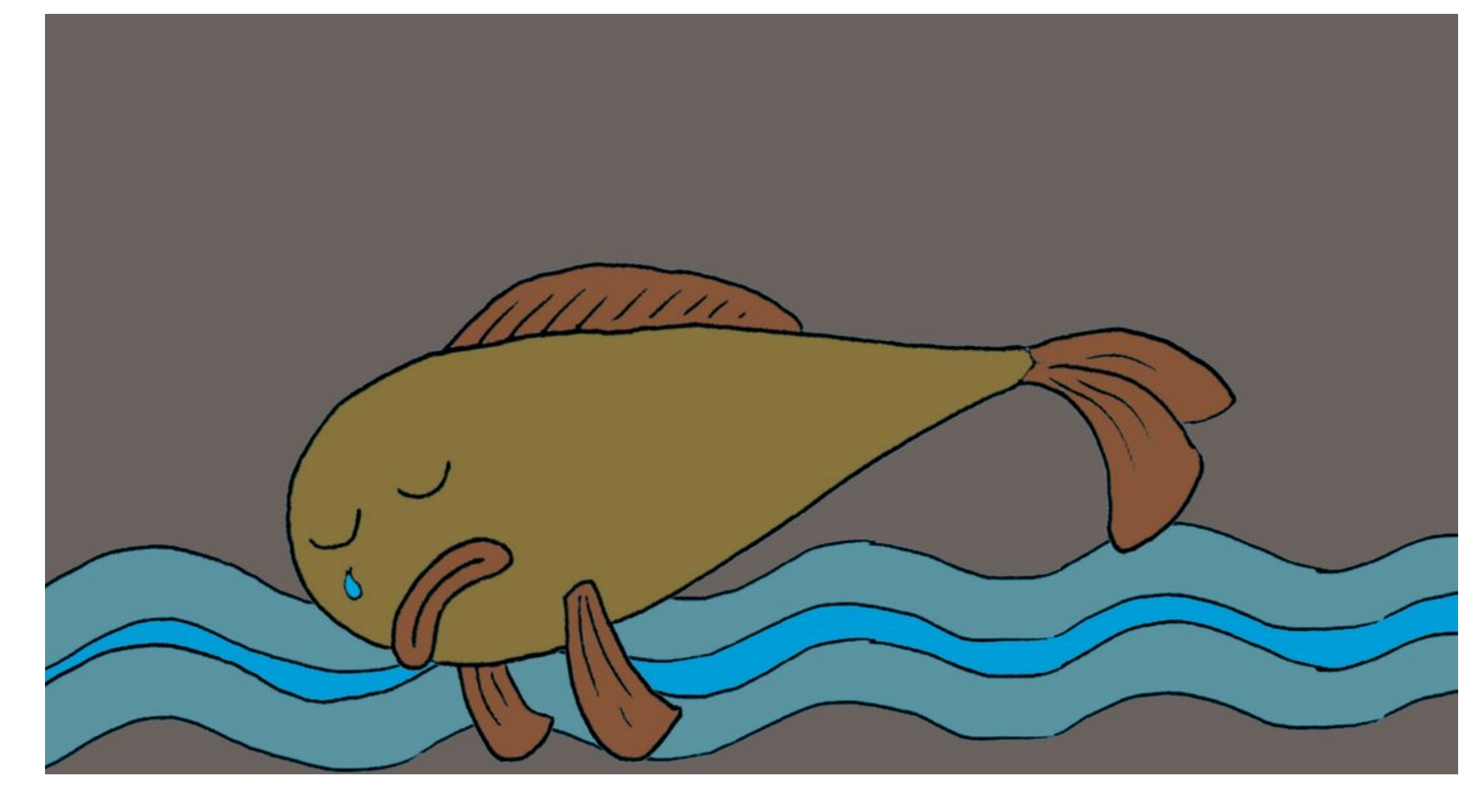
The fisherman caught the lazy third fish.